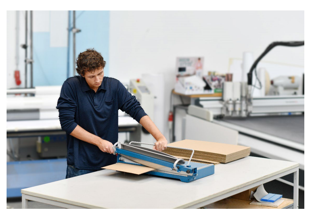
Robust design, safe and precise cuts: 'EXPERT' guillotines from Dahle are professional cutting machines for trades and industry.