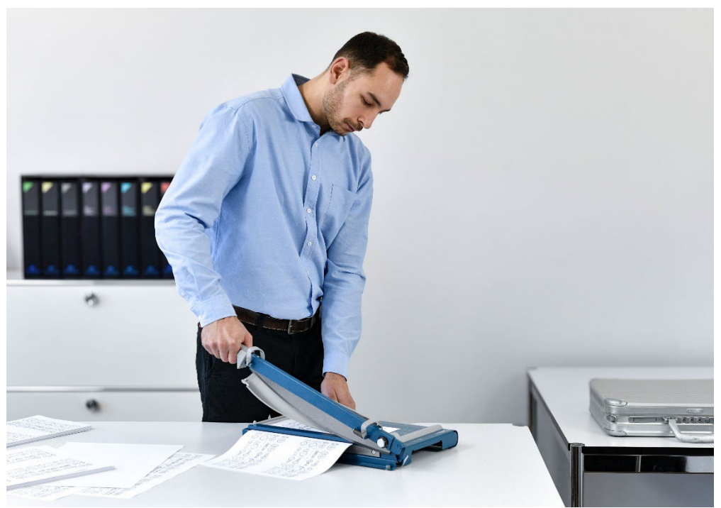
Dahle's new guillotines in the 'PRO' category are perfect for businesses, schools, workshops, and offices.