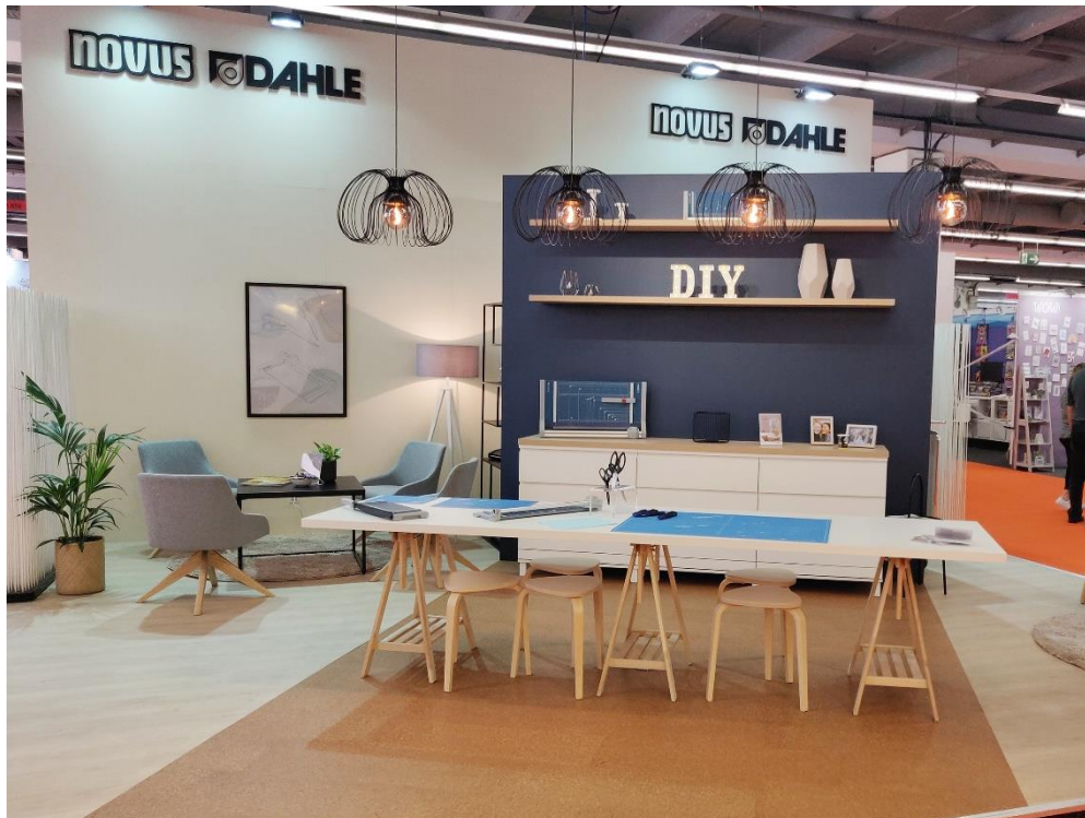
Novus Dahle presented a homely, hands-on exhibit at Creativeworld.