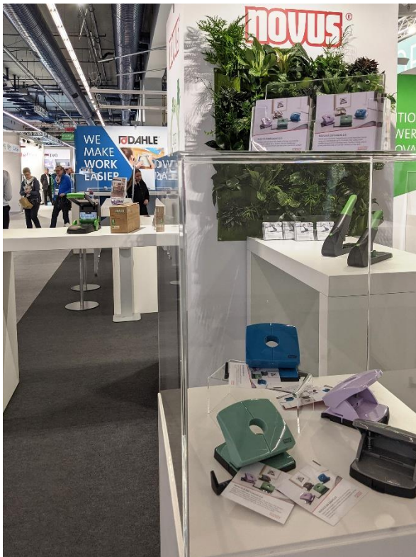
Centre stage: the much-talked-about Color ID 2023 trend colours and the re+new heavy-duty staplers by Novus.