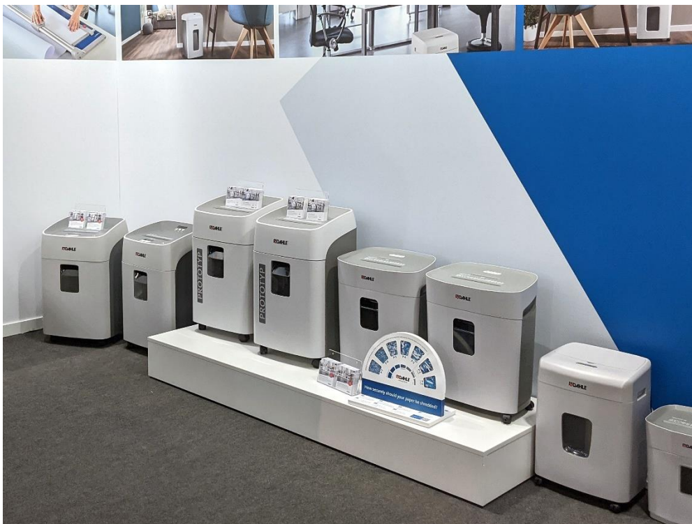
A selection of items from the Dahle document shredder range.