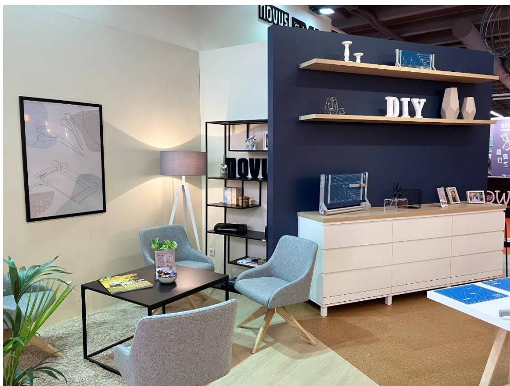
The cosy living room atmosphere attracted visitors to stop by for some crafts and conversation.