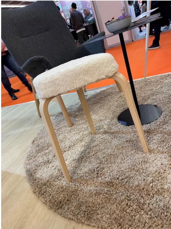
From series products to individual pieces: live upcycling with Novus hand tackers.