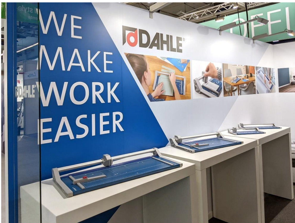
The exhibition wouldn't have been complete without the Dahle rotary trimmers.