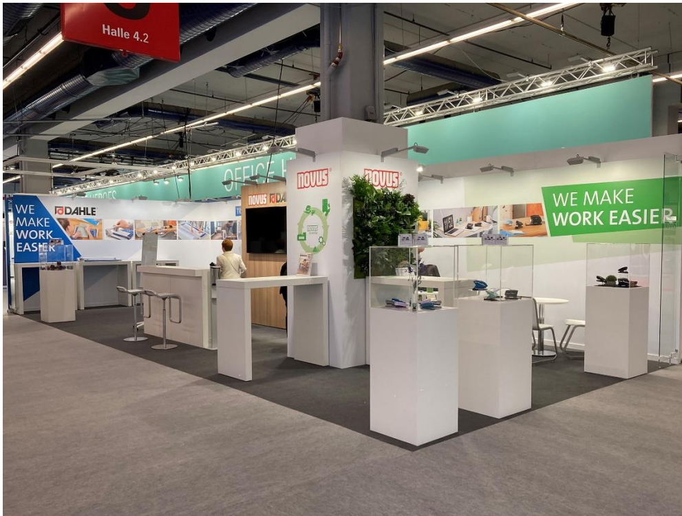
The Novus Dahle trade fair stand in the Office Heroes area at Ambiente.