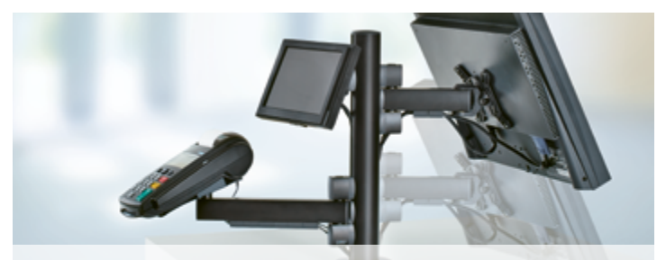
Infinitely height adjustable, the arms let you position terminals, keyboards and monitors individually.