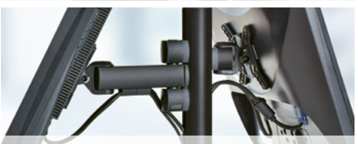
Practical cable holders provide a secure, neatly organised cable management along the arm.