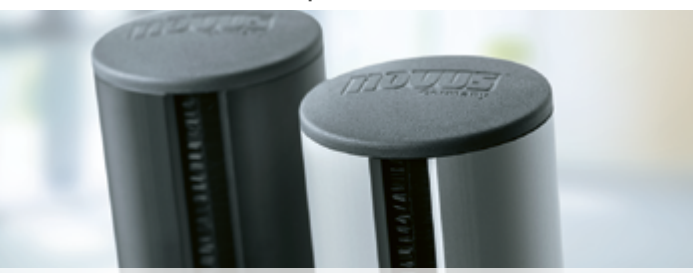
High-quality silver- or black anodised aluminium profiles. Cables are passed through the inside of the column where they are covered by practical brush seals.