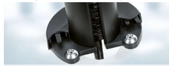
Screw-on and screw-through mounting for passing cables through the table.

Knowing what's important to you: our POS Solutions and its components.