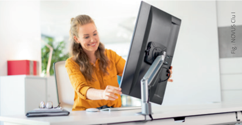
Fig.: NOVUS Clu I

The Novus Clu is very versatile: whether you're standing or sitting, the monitor can be adjusted to the optimal position even at height-adjustable desks. Wearers of varifocals can adjust the monitor to suit their field of vision. And the monitor can easily be positioned horizontally for using touch screens or to concentrate on reading, just like you would read a book.