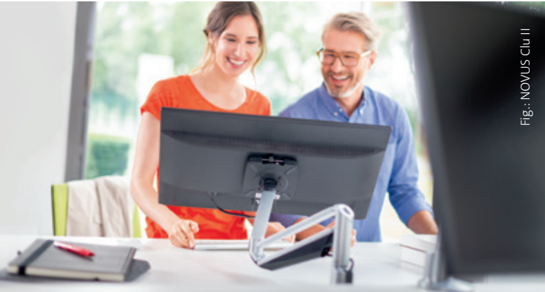
Fig.: NOVUS Clu II

Novus Clu offers top performance: elegant, comfortable, ergonomic and practical. The new monitor arms can be adjusted to the required position easily and without needing any tools.