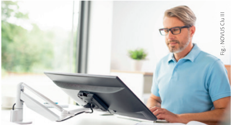
Fig.: NOVUS Clu III

Extreme flexible: even large format monitors can easily be moved into any position you like.