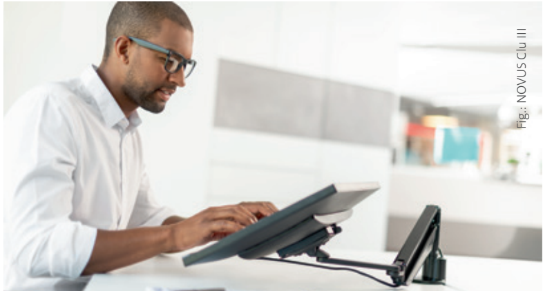
Fig.: NOVUS Clu III

Optimal tilt: Novus Clu III brings the monitor right down to the tabletop.