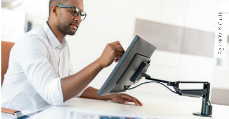
Fig.: NOVUS Clu III

Quick & easy: the pivot function makes it easy to adjust the monitor for working in portrait format.