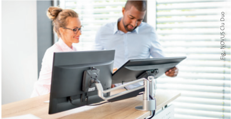
Fig.: NOVUS Clu Duo

Maximum stability: the clever support arm construction with gas spring technology keeps monitors up to 7 kg securely in the chosen position.