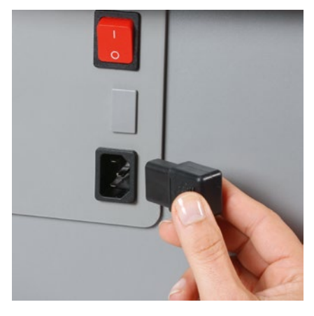
Detachable IEC power plug makes the document shredder quick and easy to move from A to B \,