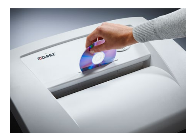
Separate CD feed opening with dedicated collection bin for environmentally friendly waste separation and secure destruction