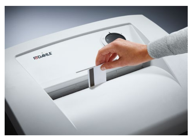
Reliably destroys cards