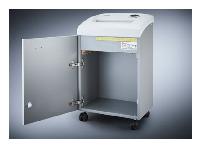
Robust wooden cabinet with doors that open wide to allow easy emptying of document shredder