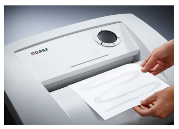
Dahle Waste 104 document shredder