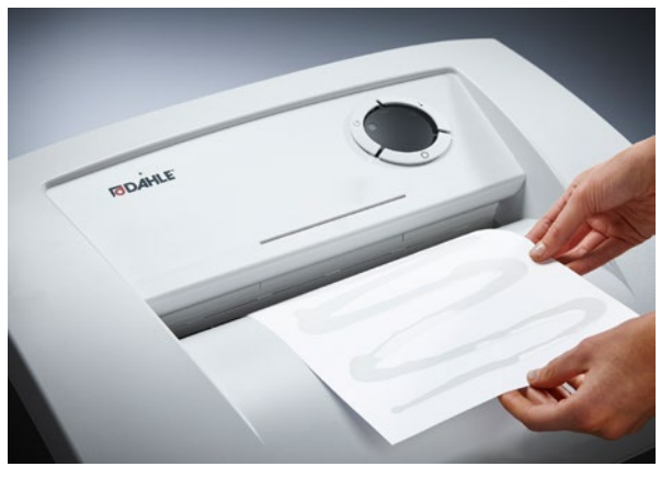
Dahle Waste 104air document shredder