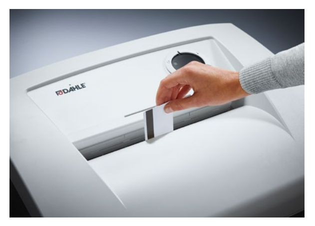
Reliably destroys cards