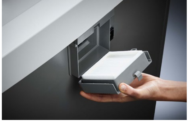
Dahle Waste 104air document shredder