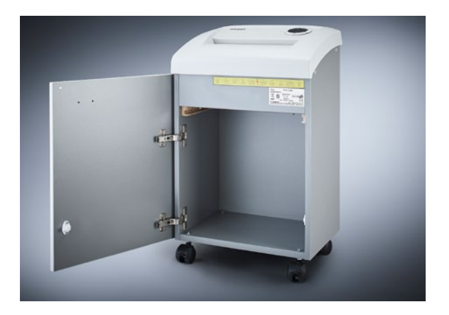
Dahle Waste 104air document shredder