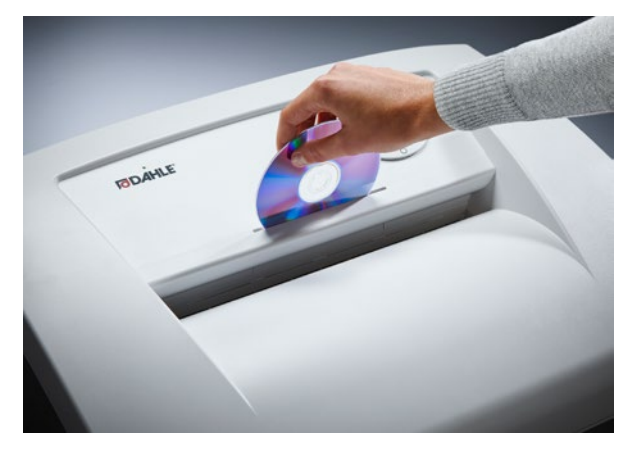
Separate CD feed opening with dedicated collection bin for environmentally friendly waste separation and secure destruction