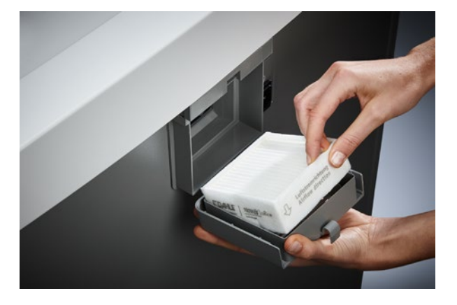
Improved indoor climate even when in heavy use: the unique DAHLE CleanTEC<sup>®</sup> filter system reduces fine dust pollution from the document shredder