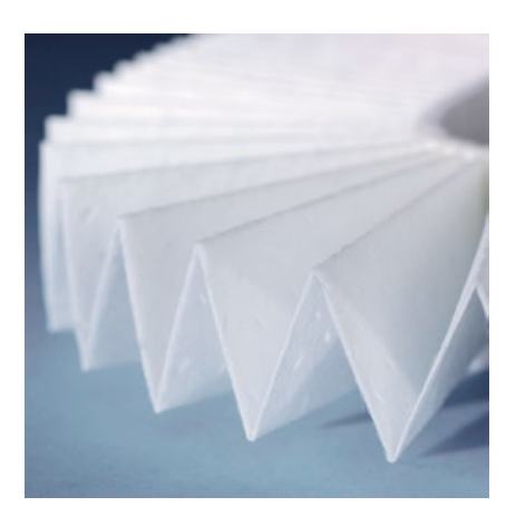
Environmentally friendly filter is made of special 3-ply, fully recyclable non-woven material