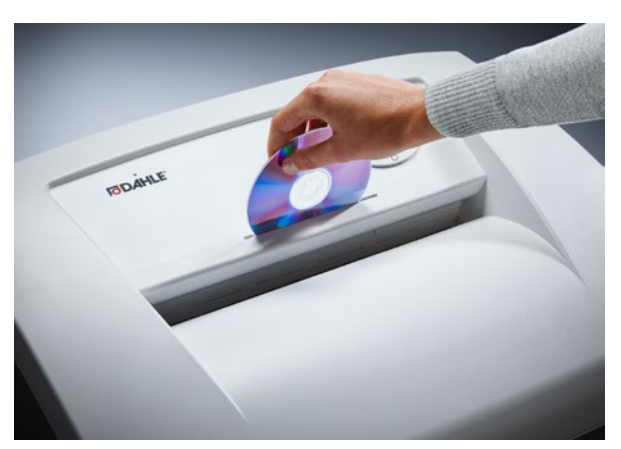
Separate CD feed opening with dedicated collection bin for environmentally friendly waste separation and secure destruction