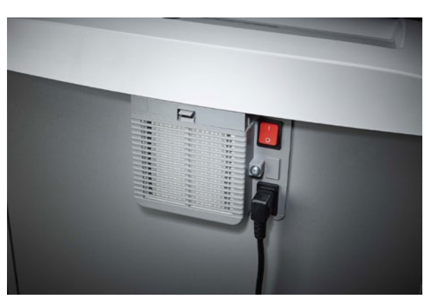
Detachable IEC power plug makes the document shredder quick and easy to move from A to B \,