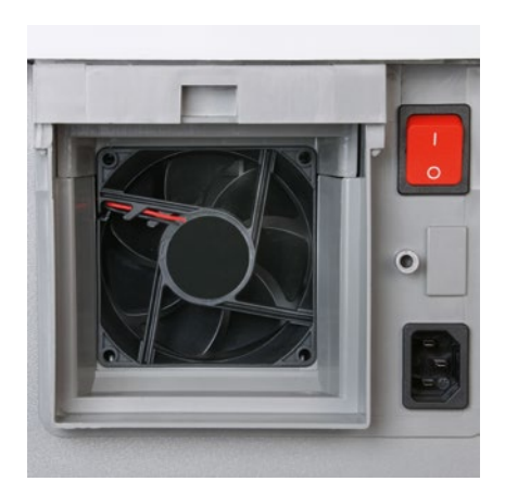
Powerful fan sucks in fine dust particles inside the document shredder and feeds them to the filter