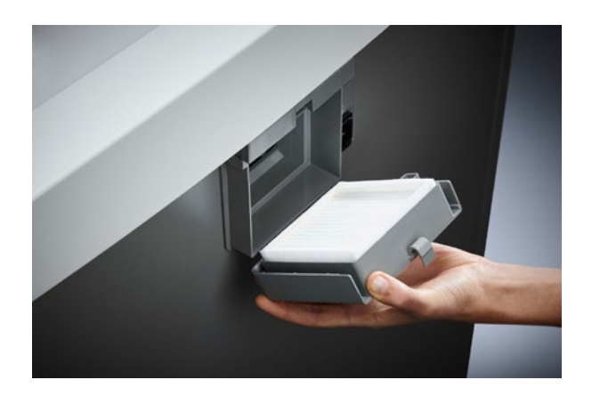
Dahle Waste 106air document shredder