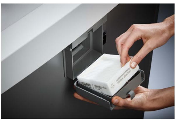
Improved indoor climate even when in heavy use: the unique DAHLE CleanTEC® filter system reduces fine dust pollution from the document shredder