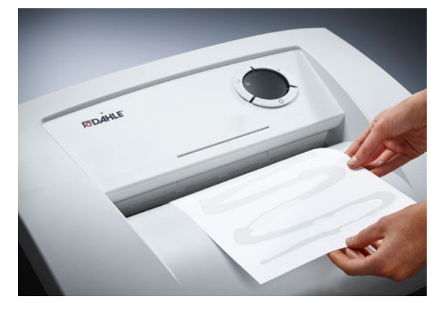
Dahle Waste 110 document shredder