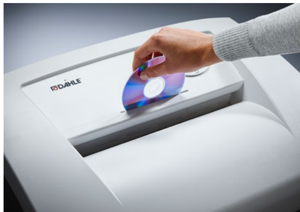
Separate CD feed opening with dedicated collection bin for environmentally friendly waste separation and secure destruction