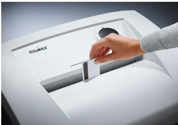
Reliably destroys cards