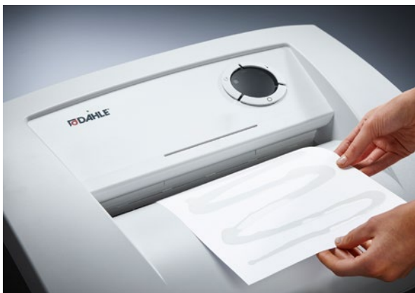
Dahle Waste 110air document shredder