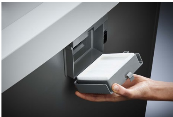
Dahle Waste 114air document shredder