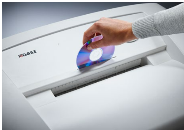
Separate CD feed opening with dedicated collection bin for environmentally friendly waste separation and secure destruction