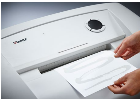
Dahle Waste 114air document shredder