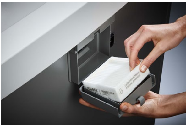
Improved indoor climate even when in heavy use: the unique DAHLE CleanTEC® filter system reduces fine dust pollution from the document shredder