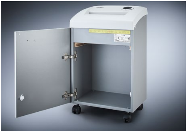
Robust wooden cabinet with doors that open wide to allow easy emptying of document shredder