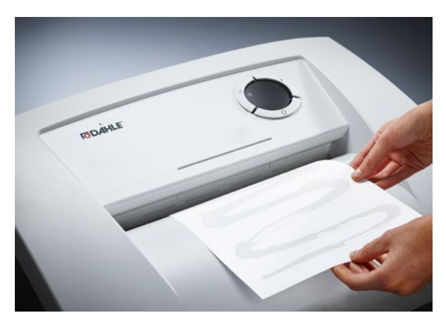
Dahle Waste 206 document shredder