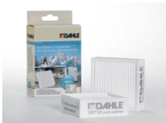
Fine particle filters Dahle 20710