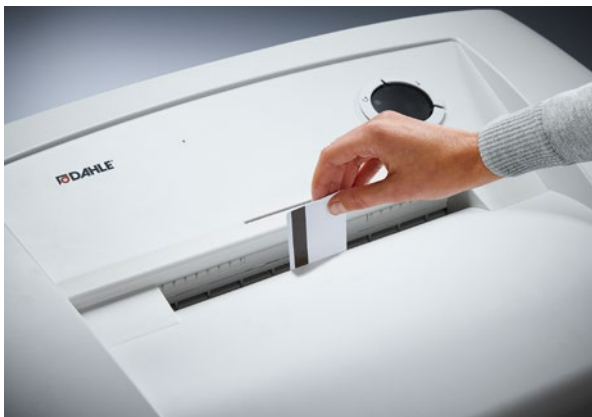
Reliably destroys cards