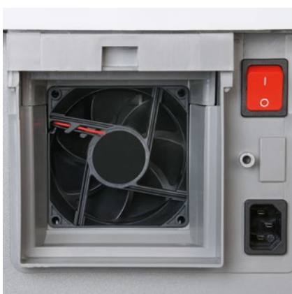
Powerful fan sucks in fine dust particles inside the document shredder and feeds them to the filter