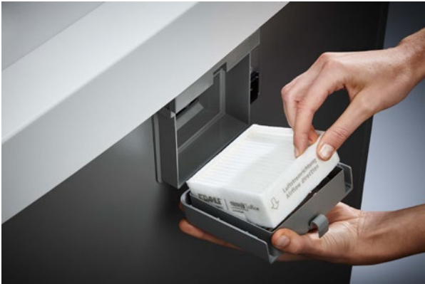
Improved indoor climate even when in heavy use: the unique DAHLE CleanTEC® filter system reduces fine dust pollution from the document shredder