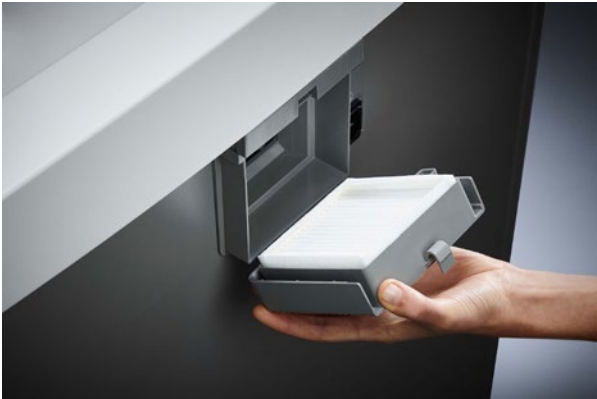
Dahle Security 504air document shredder