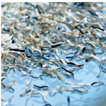
P-5 security: recommended, for example, for data media containing secret data