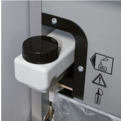
Integrated oil tank for controlled, automatic lubrication of the cross-cut cutters helps to lengthen service life while keeping performance constant