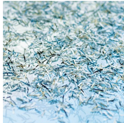
P-6 security: recommended for data media containing secret data demanding exceptionally stringent security measures