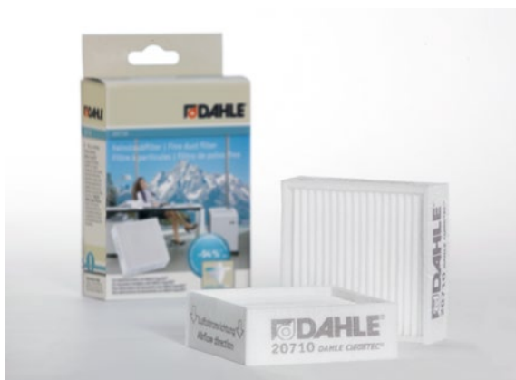
Fine particle filters Dahle 20710

Environmentally friendly filter is made of special 3-ply, fully recyclable non-woven material