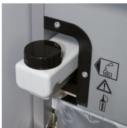
Integrated oil tank for controlled, automatic lubrication of the cross-cut cutters helps to lengthen service life while keeping performance constant