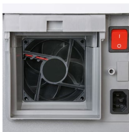
Powerful fan sucks in fine dust particles inside the document shredder and feeds them to the filter