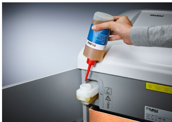
Automatic oiler for reliable shredding: simply fill with oil, the document shredder will take care of the rest