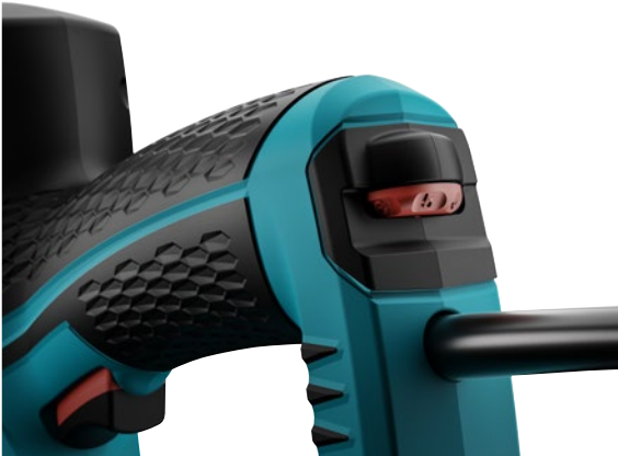
The dial for impact force adjustment is located on the rear of the electric tacker; all functional parts are red.