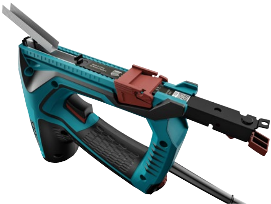
Integrated staple slider for quick loading of staples. All parts form a single unit with no loose parts to lose.