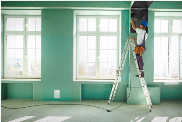
Extra-long 3-metre cable allows safe and comfortable working on ladders.