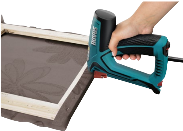
The distance holder allows you to drive in a row of staples parallel to the edge.