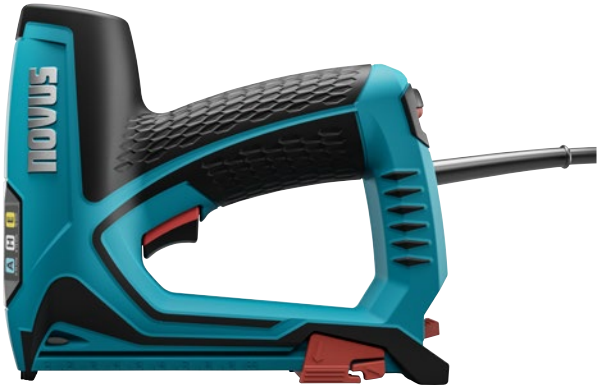
Ergonomic grip design ensures fatigue-free working.