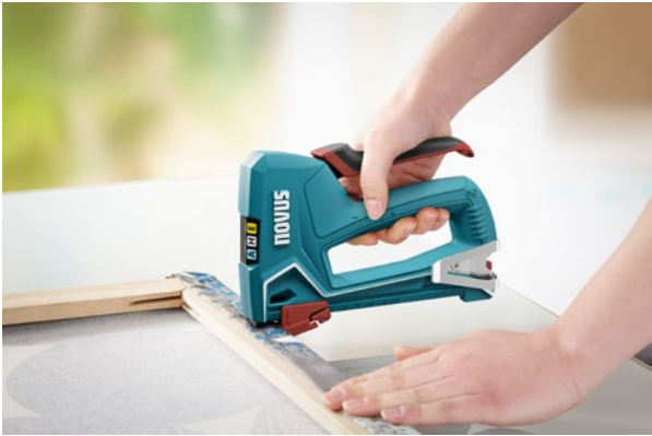
The distance holder allows you to drive in a row of staples parallel to the edge.