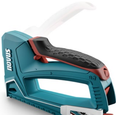
Space-saving handle lock for safe storage when not in use