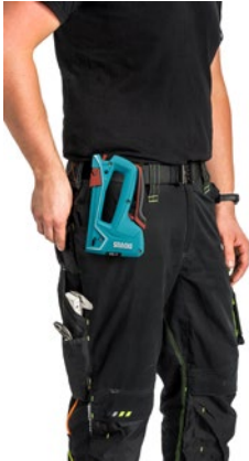
Sturdy belt hook for clipping to work clothes so device is always easily to hand.