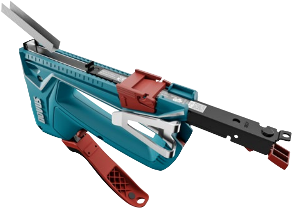
Integrated staple slider for quick loading of staples. All parts form a single unit with no loose parts to lose.