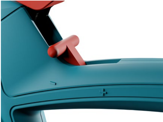
Guarantees the right impact power for every job, no matter whether you're fastening into hard or soft wood.